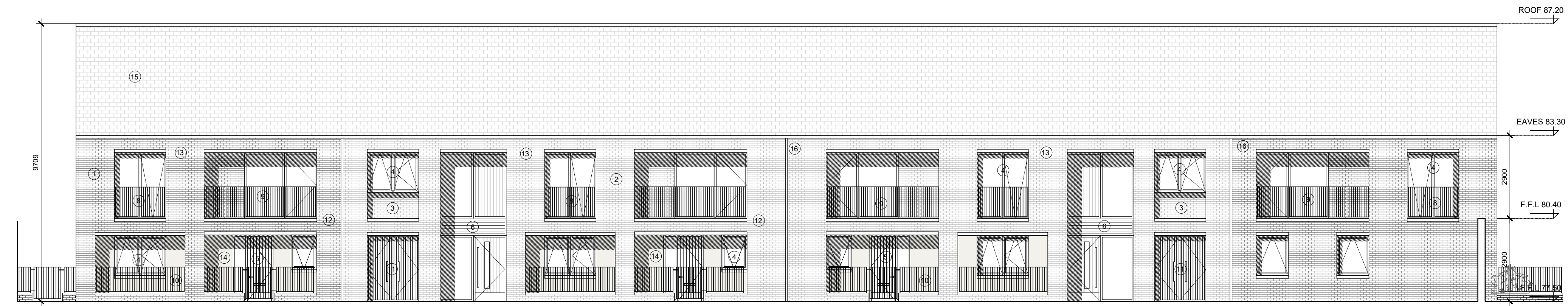
ELEVATION 6 1:100