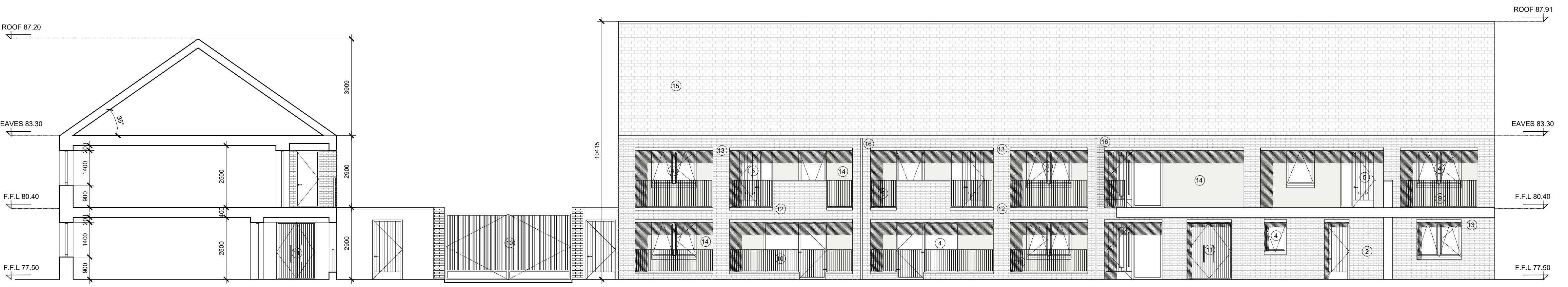
ELEVATION 7 1:100